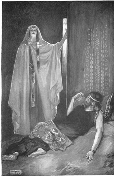
Fionn and Sava

In this chapter, Finn encounters a mysterious fawn while hunting with his two hounds, Bran and Sgeolaun. The fawn is revealed to be Sava, a maiden of the faery world who had been cursed by a druid for rejecting him. Finn falls in love with Sava, and they live happily together until Finn must leave to fight invaders. When he returns, Sava has disappeared. Finn searches for her for seven years, only to find a young boy, Oisín, who turns out to be their son. Bran and Sgeolaun, the ever-loyal hounds, protect Oisín during this discovery.