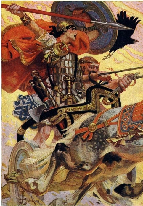
Cuchullin in battle.

Fergus Mac Roy, though leading Maeve's army into Ulster, delays their progress to protect his homeland. Maeve becomes suspicious and confronts him, but Fergus refuses to continue guiding the army against Ulster. Meanwhile, Cuchullin uses his guerrilla tactics to harass the invading forces, killing scouts and terrifying the troops with his sling. Fergus describes Cuchullin's extraordinary strength and prowess in battle, recounting his early deeds and explaining why he is known as the 'Hound of Culann.' Maeve realises that Cuchullin alone is causing significant trouble for her forces, despite his young age and relative inexperience compared to her larger army.