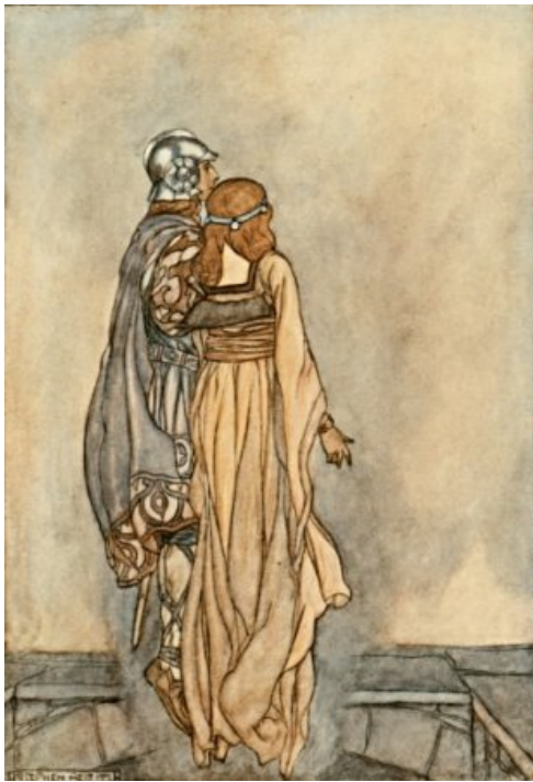
Midir and Etain

The chapter tells the story of Midir, a Faery prince, who falls in love with the beautiful Etain. Jealous of her beauty, Midir's first wife, Fuamnach, turns Etain into a butterfly and sends her away. Etain endures years of being buffeted by winds until she is eventually reborn as the daughter of a mortal queen. Midir, after years of searching, finds her again, though she does not remember him. Through a game of chess with the High King, Midir wins the right to kiss Etain, and, upon the appointed day, he takes her back to the land of Faery.