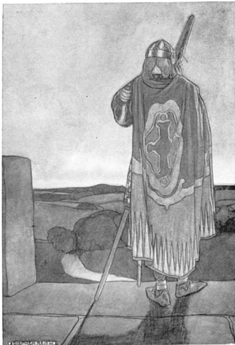
Finn Mac Cool

In this chapter, Finn's leadership and legacy among the Fianna are highlighted. He was admired for his fairness, generosity, and exceptional bravery, earning loyalty and respect from all, including his former enemies. The Fianna, under Finn's leadership, were a group bound by honour, and Finn's grandson Oscar was considered the bravest of them all. The chapter also introduces other notable Fianna members, such as the handsome Dermot and the honourable Goll Mac Morna. Finn and his warriors lived on the Hill of Allen, and legends of his two faithful hounds, Bran and Sgeolaun, persist in local folklore.