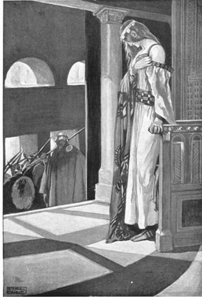
Deirdre of the Sorrows.