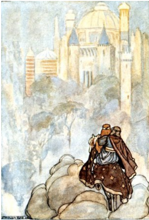
Oisín and Niav ride to Tír na nÓg , the Land of the Ever Young.

In this chapter, Oisín, son of Finn Mac Cool, is swept away by Niav of the Golden Hair to live in the Land of the Ever Young, where no one ages and life is filled with joy and beauty. Oisín spends many years in blissful happiness, but he often dreams of his former life with the Fianna, longing for the hunts and companionship he left behind. Eventually, Oisín decides to return to Ireland, but upon setting foot on Irish soil, he instantly ages, realising that hundreds of years have passed. The magical life he once knew is gone, and Oisín is left an old, frail man.