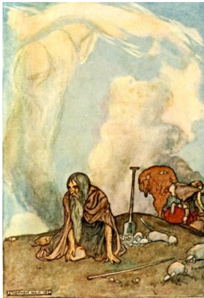
Oisín falls from his steed.