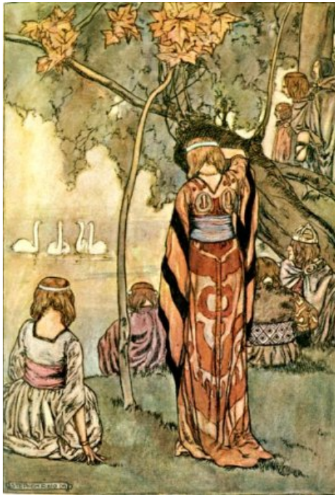
The people of Dana mourn the Children of Lir.

The Children of Lir tells the tragic tale of Lir, who married two of King Bov the Red's foster daughters, first Eve, and then her sister Eva. While Eve gave Lir four beloved children, Eva grew jealous of the affection the children received and cursed them to live as swans for 900 years. The children spent centuries wandering the lakes and seas of Ireland, where their music brought comfort to those around them. Eventually, the sound of Christian bells marked the end of their enchantment, and the swans transformed back into humans, though aged and frail. Holy Kemoc baptised them before they peacefully passed away, ending their long and sorrowful journey.