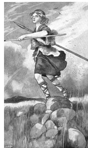
The young Setanta, later called Cuchullin.