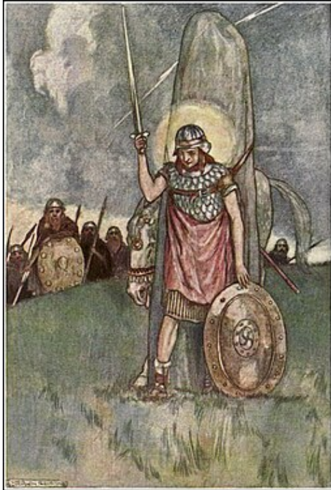
The death of Cuchullin.