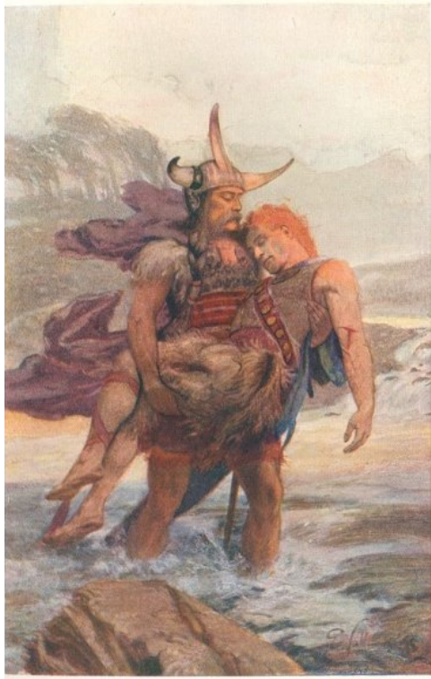
Cuchullin carries Ferdia across the ford.