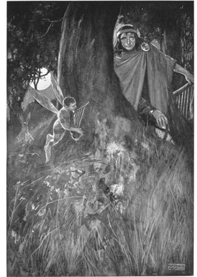
King Fergus Mac Leide and the Wee Folk.